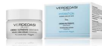
V0819 - 50 ml NOURISHING CREAM hydrating Hyaluronic Acid - Filaggrin

It performs a repairing action on skin affected by dryness and aging, combining the penetration capacity of a serum to the comfort of an oil.