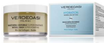
V0825 - 200 ml INVISIBLE MASK super hydrating Marine Collagen - Kudzu

Innovative and invisible gel formula that gives instant hydration and freshness. Signs of fatigue are reduced and skin appears immediately hydrated, smooth and fresh.