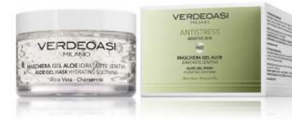
V0843 - 200 ml ALOE GEL MASK hydrating soothing Aloe Vera - Chamomile

Applied on troubled areas, it forms a protective film that prevents alteration of the natural cutaneous barrier. It placates redness, decreasing itchiness and feeling of pulling skin.