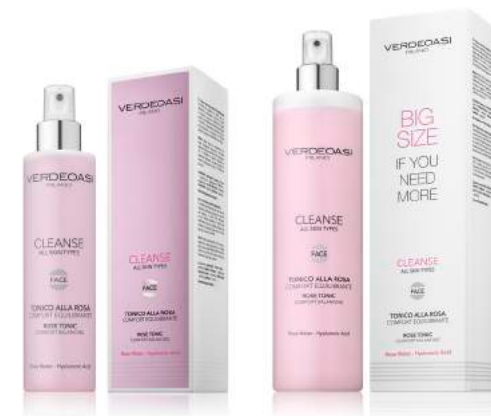
V0805 - 200 ml / V0805P - 500 ml ROSE TONIC comfort balancing Rose Water - Hyaluronic Acid

It offers an invisible protective film after cleansing. It reduces pores, leaving a velvety touch and even skin texture.