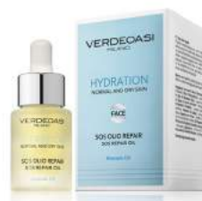
V0823 - 15 ml SOS REPAIR OIL Avocado oil

Innovative and invisible gel formula that gives instant hydration and freshness. Signs of fatigue are reduced and skin appears immediately hydrated, smooth and fresh.