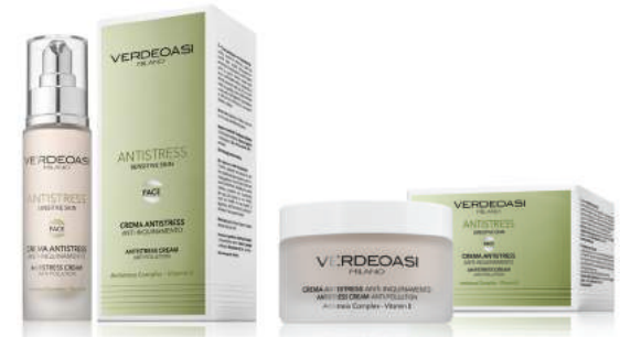
V0841 - 50 ml / V0841P - 200 ml ANTISTRESS CREAM anti-pollution Antistress Complex - Vitamin E

Created to soothe sensitive skin, easily irritated and reddened by stress, cold, wind and temperature changes. It has a moisturizing, soothing and protective action that refreshes and softens the skin.