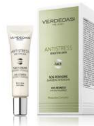
V0840 - 15 ml SOS REDNESS intensive barrier Protective Complex

It calms, balances and protects the skin from damages caused by internal and environmental stress factors, such as pollution. Immediately encircled by relief and protection, face will appear soft and relaxed.