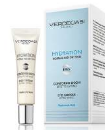
V0833 - 15 ml EYES CONTOUR lifting* effect Hyaluronic Acid

Rich texture that blends with the skin for maximum comfort. Dry and fragile skin gains immediate nourishment.