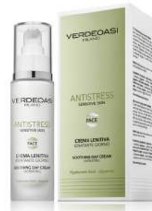
V0844 - 50 ml SOOTHING DAY CREAM hydrating Hyaluronic Acid - Liquorice

Created to soothe sensitive skin, easily irritated and reddened by stress, cold, wind and temperature changes. It has a moisturizing, soothing and protective action that refreshes and softens the skin.