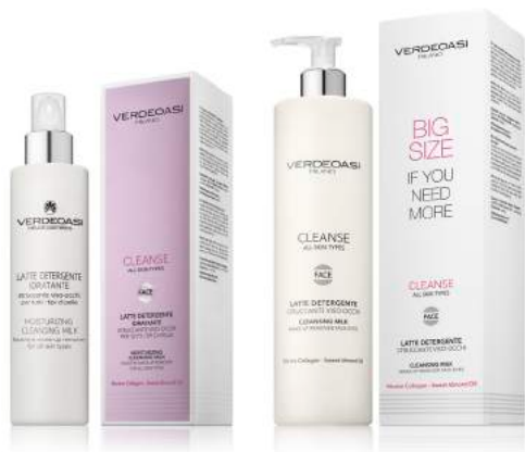
V0800 - 200 ml / V0800P - 500 ml CLEANSING MILK make up remover face-eyes Marine Collagen - Sweet Almond Oil

Creamy and enveloping texture that removes make-up and impurities from face, neck, eyes and lips.