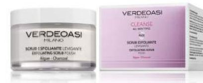
V0806 - 200 ml EXFOLIATING SCRUB - polish Algae - Charcoal

It offers an invisible protective film after cleansing. It reduces pores, leaving a velvety touch and even skin texture.